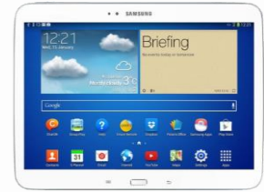
Your device anywhere