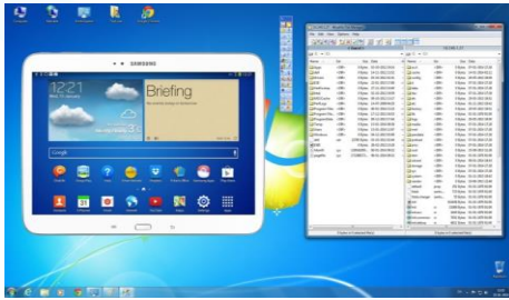
Tablet viewed remotely from Windows desktop Simultaneous split-screen file transfer